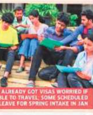
Students in Canada and those planning to leave their studies in the coming weeks there are a panicky lot with the visa and Canada situation escalating to a bigger crisis with India suspending visa services to Canadians.

Going forward however there could be changes in the visa policy and/or visa approval process and rates which may hurt the next batch of students heading to Canada. The current session would also impact the destination choice of many students who are in the process of finalising their study abroad plans.